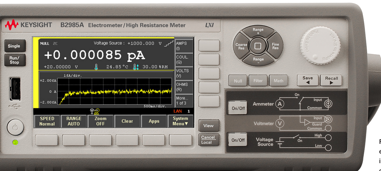
Features in the B2985A ensure measurement integrity through external cables and fixtures